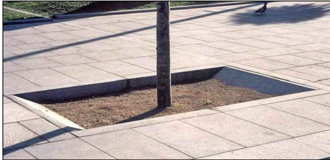
TREE PLANTER WITHIN PUBLIC REALM

All plants to BS 3936. Planted as per specification