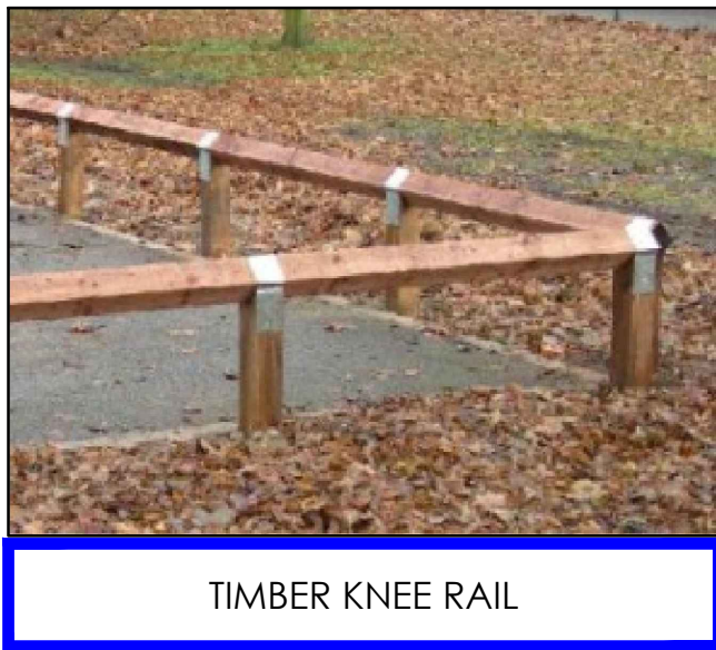
TIMBER KNEE RAIL