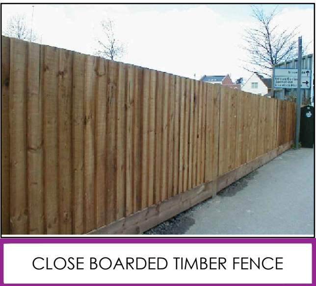
CLOSE BOARDED TIMBER FENCE