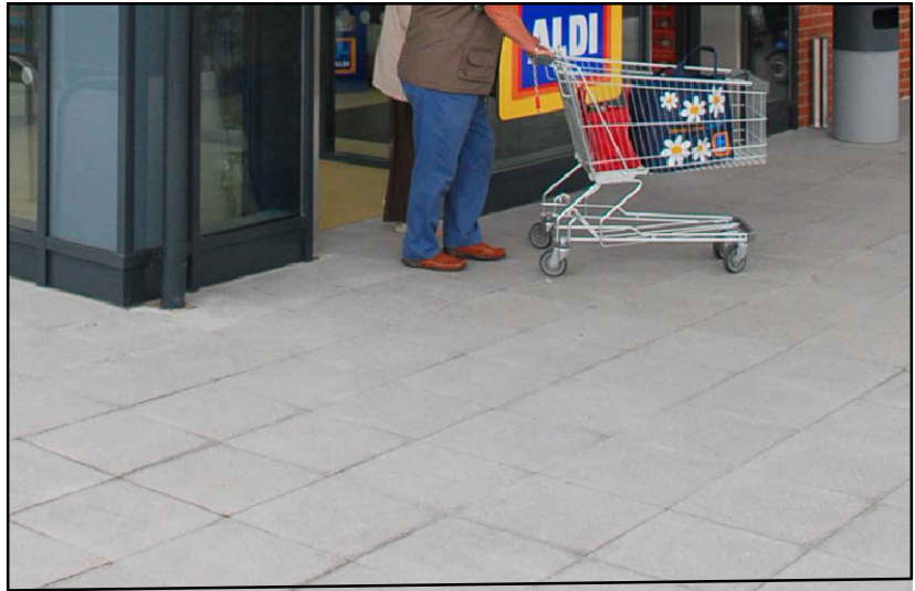
MARSHALLS CONSERVATION PAVING TO STORE ENTRANCE