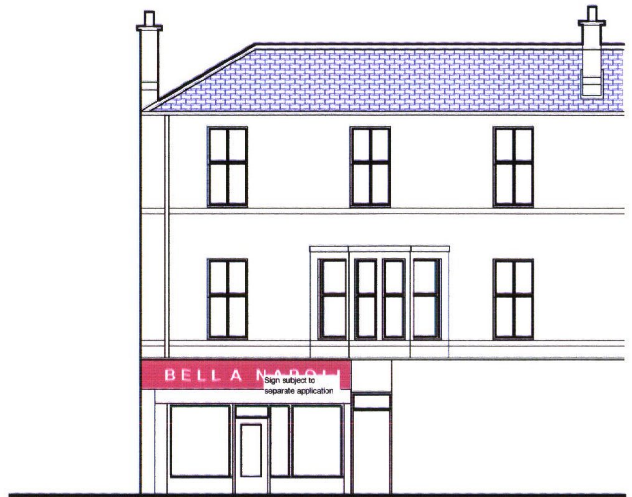
Plan as existing