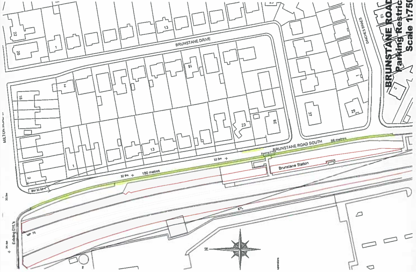
BRUNSTANE ROAD SOUTH Parking Restrictions Scale 1:750