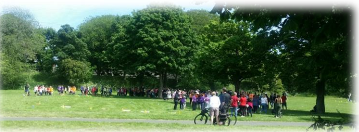
The feedback from the kids and the teachers has been really good and we have noticed an improvement in the Parks as well: less litter, less vandalism.