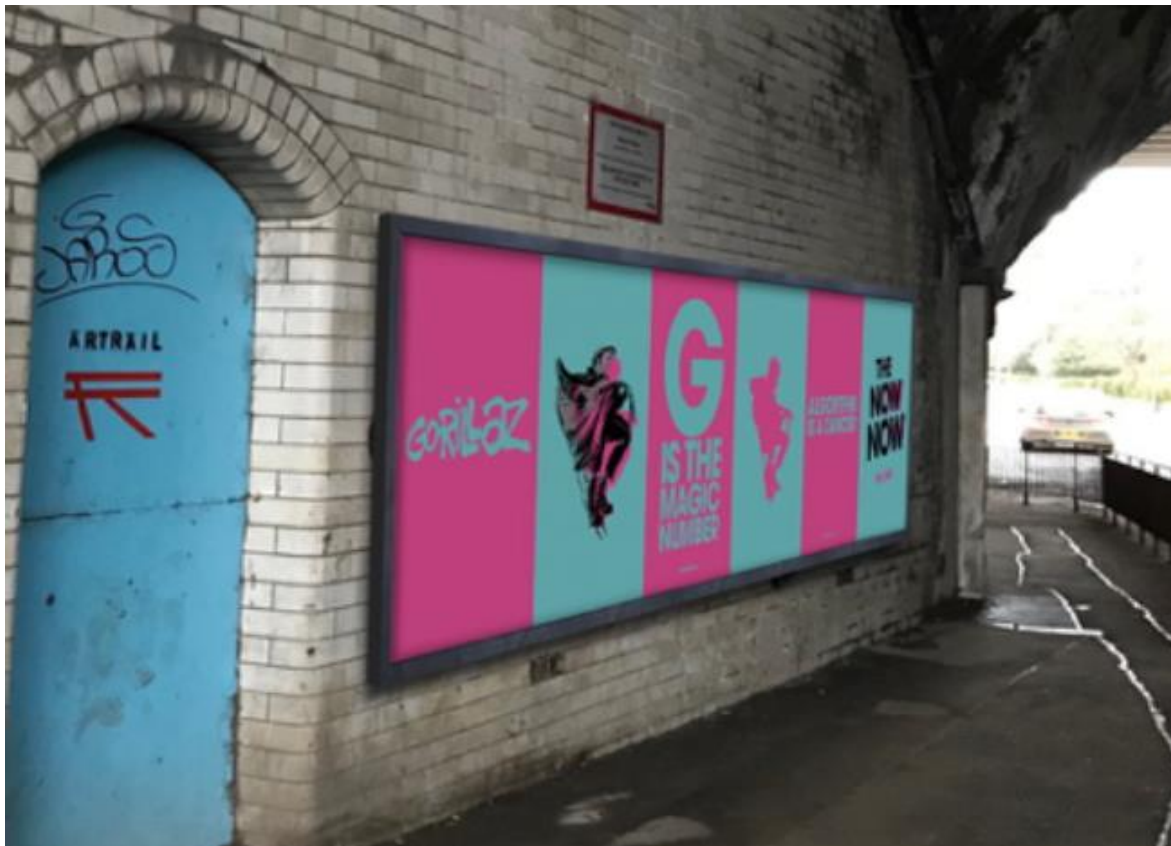
Mock-up of the proposed advertisement display

This application proposes the display of a 1664mm by 6235mm poster advertising panel on the west wall of the road tunnel at Southfield Place in Portobello.